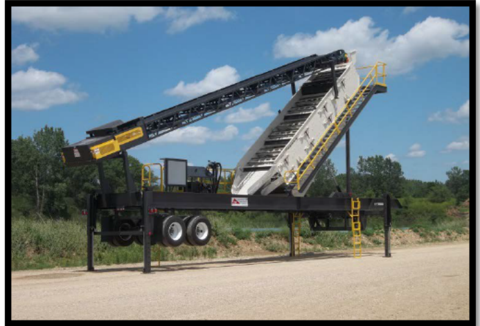
6x24 PTSC XL