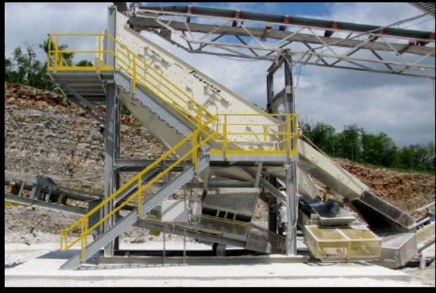
Stationary or Skid-Mount