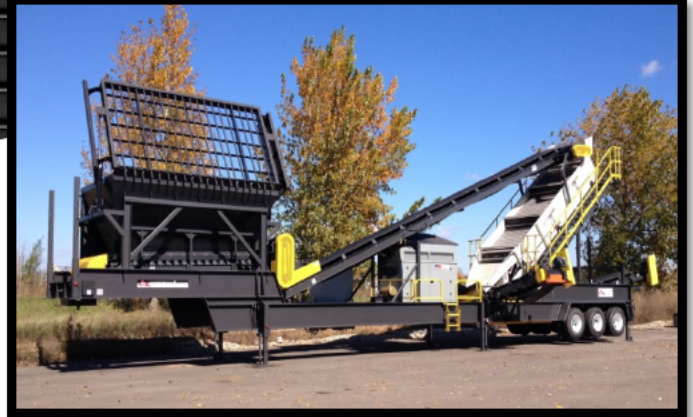
6x18 PSB Plant